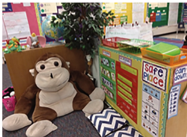
Classrooms throughout the district offer a “calm down corner” with resources to help students regulate their emotions.

Informed by child development research, the district recognizes that positive teacher-student relationships help shape students’ experiences in school and can have a lasting impact on students’ emotional well-being and academic success. In fact, research reveals that strong teacher-student relationships are associated with both short- and long-term improvements in students’ academic engagement, attendance, and grades, and in schools’ suspension and dropout rates, even after controlling for student, family, and school demographic characteristics. 5 As one CVESD site leader noted, “You can’t educate their minds until you’ve reached their hearts.”