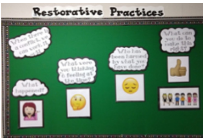
Hallway displays on restorative practices encourage students to reflect on behavior and repair relationships.

The focus on SEL has also led the district to take a different approach to student discipline. Rather than relying primarily on traditional methods such as suspensions, educators now also use an alternative, and research-based, form of student discipline known as restorative practices. 8 Restorative practices aim to turn conflict into teachable moments that can be used to improve a student's behavior instead of simply removing a student from the classroom environment. 9 Matthew Tessier, Assistant Superintendent of Innovation and Instruction Services, noted the