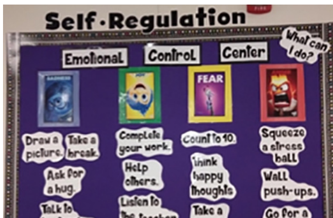
Hallway displays at a CVESD elementary school reaffirm students' emotions and offer tips for self-regulation.

teachers can decide when and how to best spend that quarter hour.